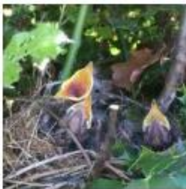
Kieran found baby birds in his garden and has been helping to protect them.

Alfie ate apples this week which is a new food for him - fantastic Alfie! What new food will you try next?