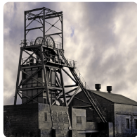
Firedamp and Davy Lamps