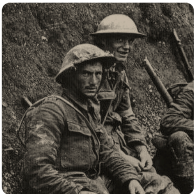
Britain at War