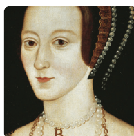
Off with Her Head!