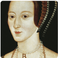
Off with Her Head!