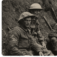
Britain at War