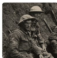
Britain at War